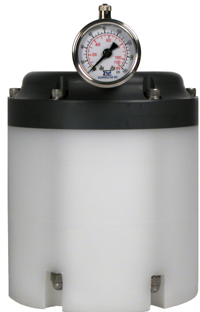
40 cu in