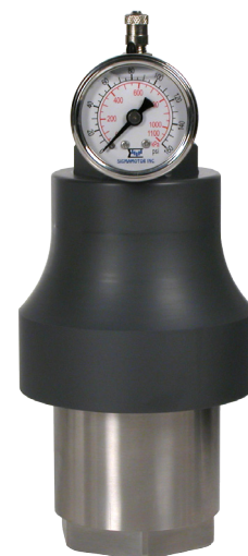
12 cu in