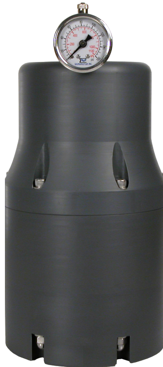
85 cu in