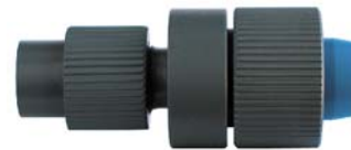
3/8" PE Tubing Adaptor