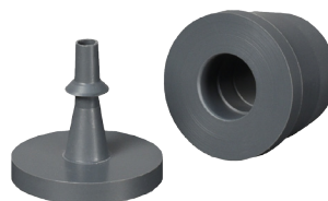
Barbed fittings assure leak free tubing connections